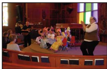
Nursery School students celebrate Purim, as well as the anniversary of the birth of Dr. Suess.