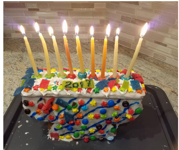
Gingerbread Menorah Fundraiser