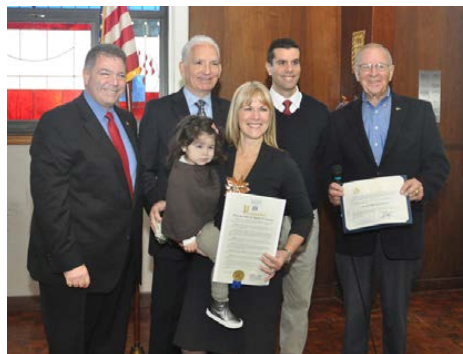
Nassau County Honors