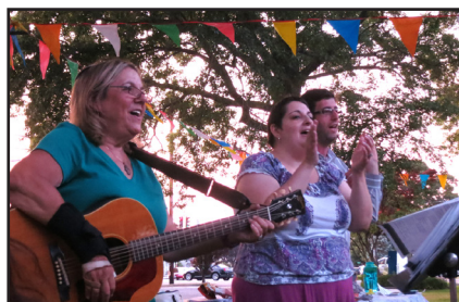
TBT Picnic Service