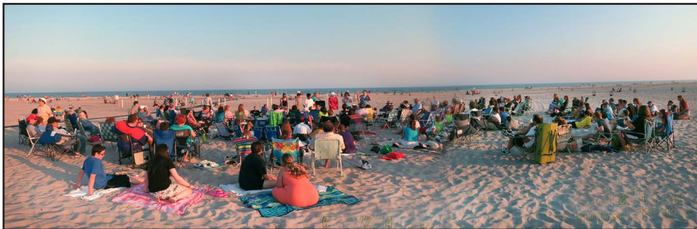
TBT Beach Service