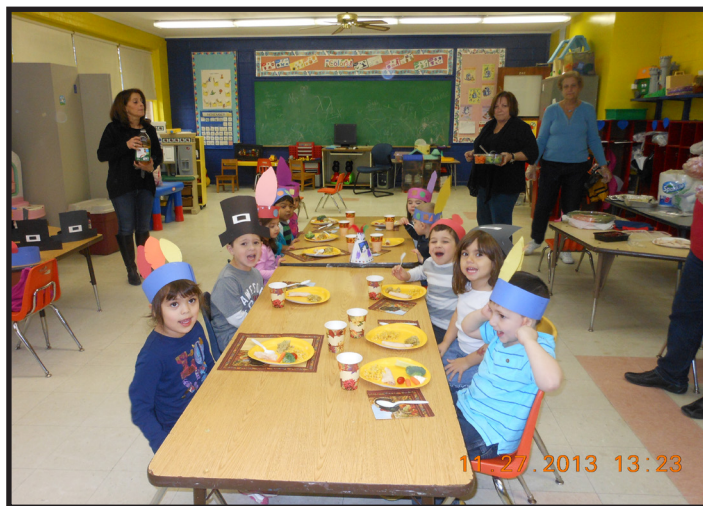
Students from the TBT Nursery School celebrate Thanksgiving together.